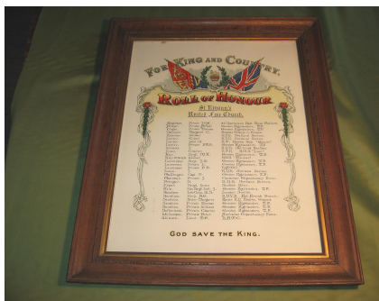
Roll of Honour for men of St Ringan's lost in WWI

a token of lasting gratitude / to the men from this church / who died for King and Country / 1914 – 1919 / (list of names follow) / well done thou good and faithful servant enter / thou into the joy of thy Lord'. The second (above left) reads; 'Dedicated to the Glory of God / and in loving remembrance of the men of / St Olaf's Church / who gave their lives in the Great War 1914 –1918 / (list of names follow) / 'Greater love hath no man than this'. A roll of Honour for the men from St Ringan's who died in WWI in framed paper form (left) is also held by the Shetland Museum. It reads: 'For King and Country / Roll of Honour / St Ringan's / United Free Church / (list of names follow) / God Save